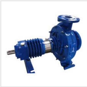
Industrial Hot Oil Pump