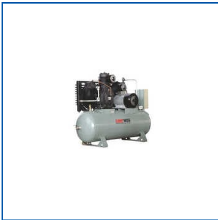
INDUSTRIAL AIR COMPRESSOR

Compressed Air Piping System, Industrial Air Compressor, Industrial Aluminium Piping System, Industrial Chemical Process Pump, Industrial Hot Oil Pump, Industrial Pipe Installation Services, etc.