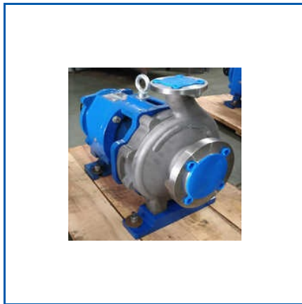
INDUSTRIAL CHEMICAL PROCESS PUMP