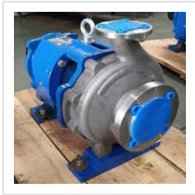
Industrial Chemical Process Pump