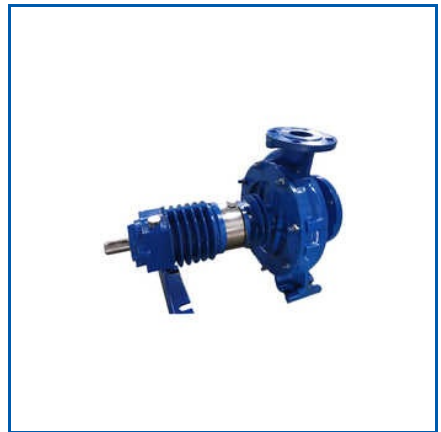
INDUSTRIAL HOT OIL PUMP