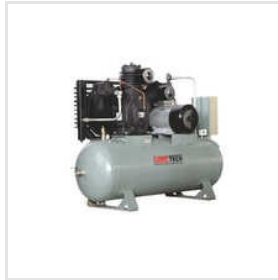
Industrial Air Compressor