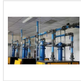
Industrial Pipe Installation Services